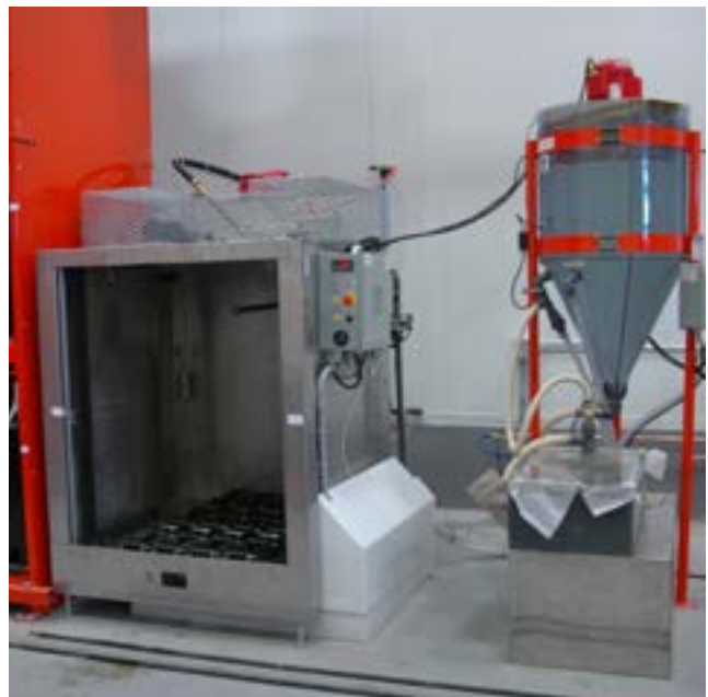
ABM - with attachable WWT (Wastewater Treatment System)