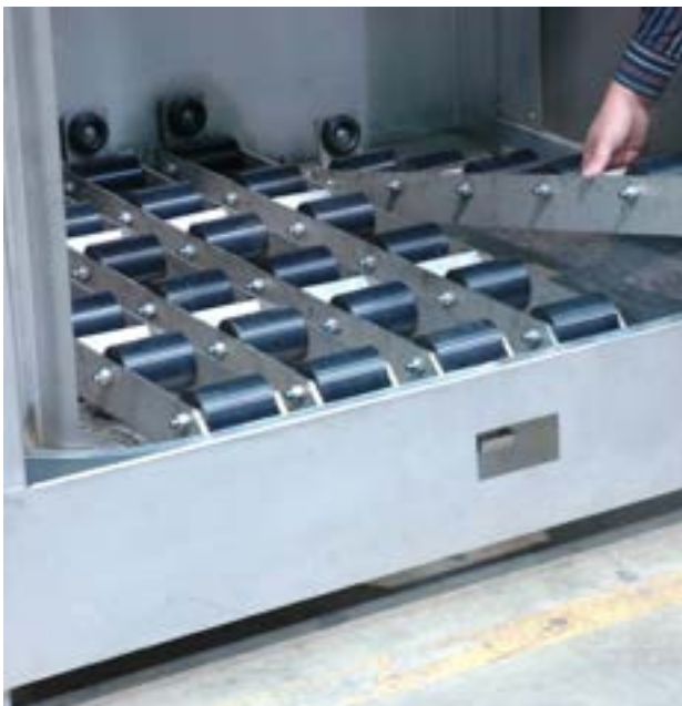
ABM - removable stainless steel roller strips